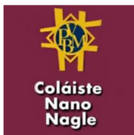
Coláiste Nano Nagle, Limerick City